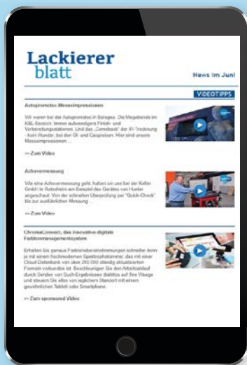
Bi-Monthly Video Newsletter

We would be happy to send you a detailed presentation about this form of advertising and other options in print and online.