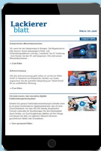
Bi-Monthly Video Newsletter

Individually bookable special newsletter for the exclusive distribution of your advertising message.